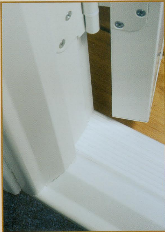
Reinforced Welded Frame

Developed in response to market demand, International Window proudly presents the Lanai Series 5000 vinyl-hinged out-swing door. Many design and structural details have been meticulously crafted into this beautiful door which in many ways surpasses its competition. The Lanai door's design is not only beautiful, but structurally sound using aluminum stiffeners to enhance its stability. Available in both single panel and french door options, the Lanai door features continuous sight lines which provide fluidity to your home's exterior. Energy efficient and secure, the Lanai's architectural beauty provides endless opportunities to enhance and compliment the design of your home.