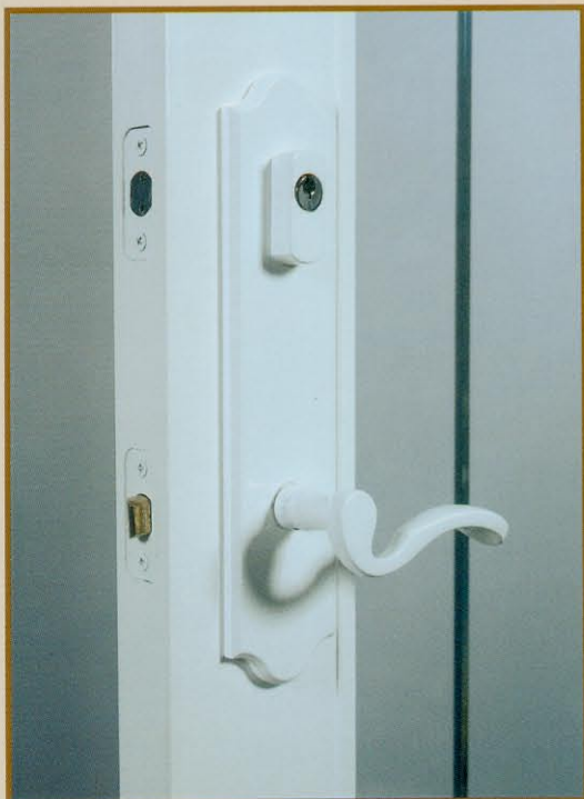
Standard White Hardware w/optional Plate