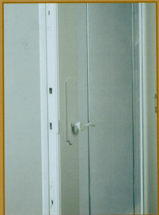
Standard Hardware, Inactive Panel