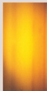
Other Vinyl: Too much light coming through