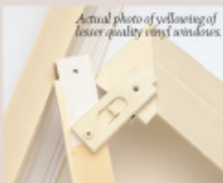
Actual photo of yellowing of lesser quality vinyl windows.

Western climates, arid deserts and high altitude where the sun can be more intense, it is reassuring to know that our vinyl is formulated specifically to meet the intense demands of our region. Discoloration can occur in lesser quality vinyl, or with formulas designed for the East Coast, and may cause a color shift from a crisp white to a dingy yellow. AMSCO Windows uses color-stabilized vinyl to prevent discoloration and keep windows looking new. They are made with the highest quality vinyl in the industry that is tested and proven to stand up over time in our tough climate.