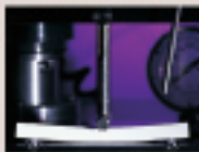
Deflection Temperature Test

At AMSCO, a window is more than just the sum of its parts. It's also the culmination of more than fifty years' experience manufacturing state-of-the-art products. Each window bears a legacy of innovation and design—a union of form and function that's easy to use, durable, energy efficient and beautiful for life.