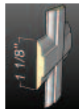
1 1/8 inch simulated divided lites are applied to exterior and interior of the glass