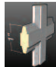
1 inch sculptured are placed between the glass