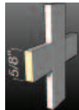
5/8 inch flat are placed between the glass

The Renaissance Series gives you a multitude of grid options. The grids are available in 5/8 inch flat, 1 inch sculptured and 1 1/8 inch simulated divided lite grids.